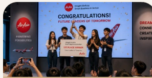
Gain Recognition & Future Opportunities