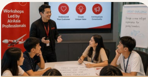
Workshops Led by AirAsia Professionals