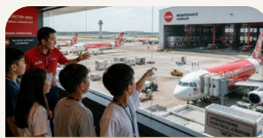
Exclusive Behind-the-Scenes Exposure