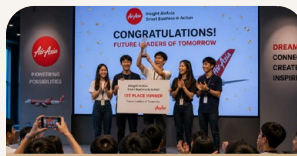
Gain Recognition & Future Opportunities