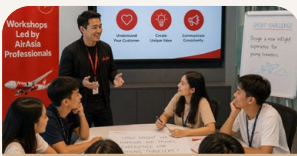
Workshops Led by AirAsia Professionals