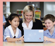
Australian Lesson & Half day excursion Indigenous Experience