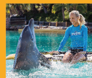
Full day excursion : Sea World