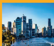
Full day excursion : Brisbane Landmarks