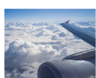
Depart from Brisbane to BKK