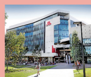
Australian Lesson & Half day excursion Griffith University