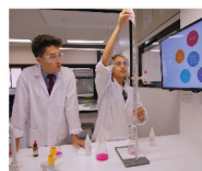
Australian Lesson & Green Energy Lab