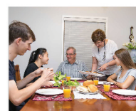
Free-day with host family