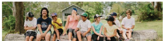
Outdoor Education Camp