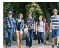
Arrive in Brisbane, Meet host families