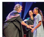
Graduation Ceremony & Activities