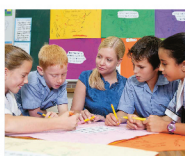
First Day Orientation & Classes