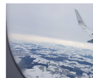
Depart from Thailand to Brisbane