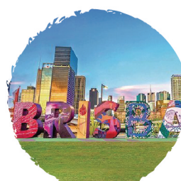
Brisbane City Tour