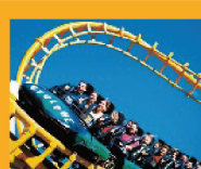
Full day excursion : Dreamworld