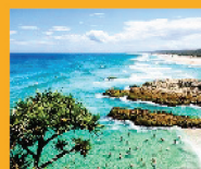
Full day excursion : Stradbroke Island