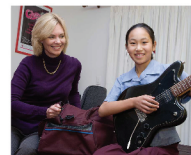
Free-day with host family