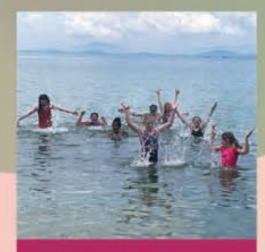
Day 6 : Aquatic Study

Full Day Excursion: Rayong Trip & Laem Mae Pim Beach Night at Hotel