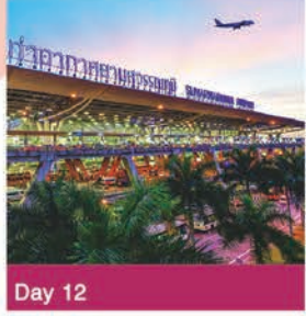
Depart from Bangkok Back to Melbourne